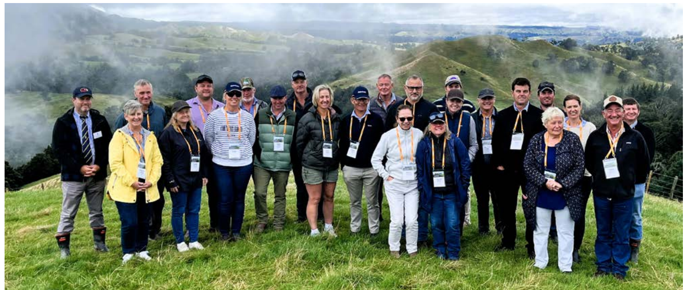
BMP Alumni Tour, Hawke's Bay, NZ 2024