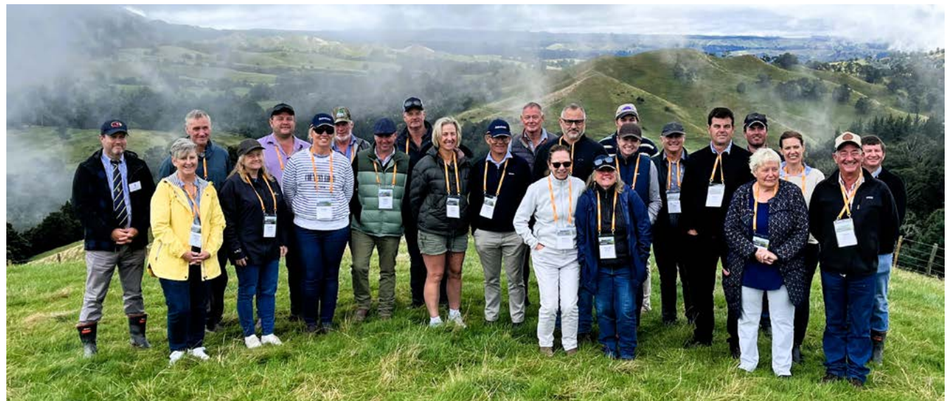
BMP Alumni Tour, Hawke's Bay, NZ 2024