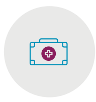
Allied Health Professionals