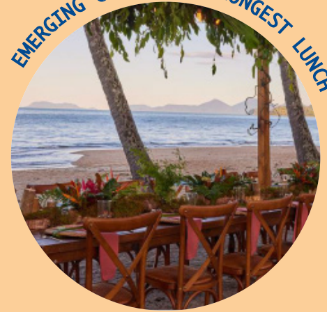
EMERGING GENERATION LONGEST LUNCH