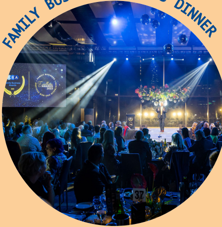
FAMILY BUSINESS AWARDS DINNER