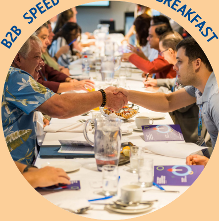
B2B SPEED NETWORKING BREAKFAST