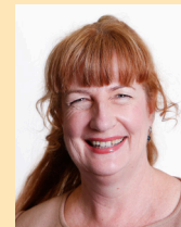
Environmental Modifications: Catherine Bridge