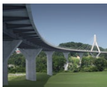
Pont de la Poya (CH)