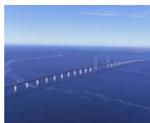
Øresund Bridge (DK/SE)