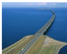
Storebaelt West Bridge (DK)