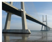
Vasco da Gama Bridge (PT)