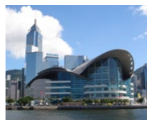
Conference Centre (HK)