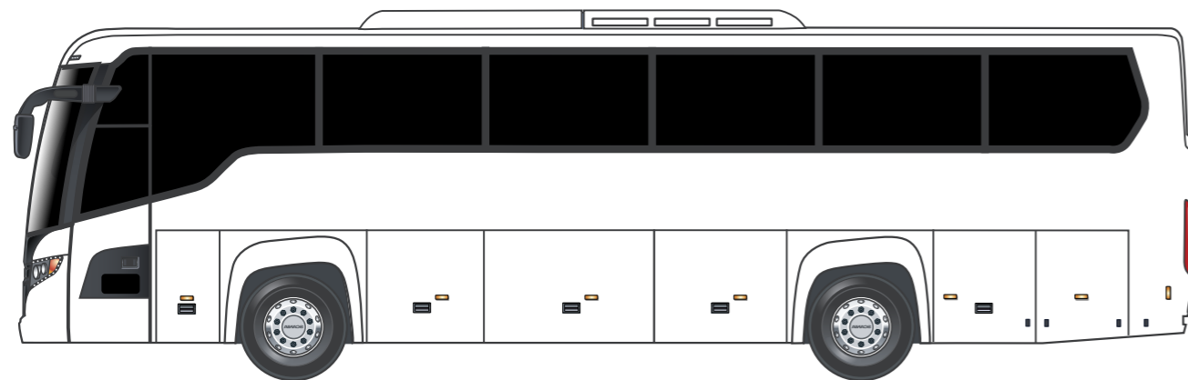
2-axles, 12.3 m