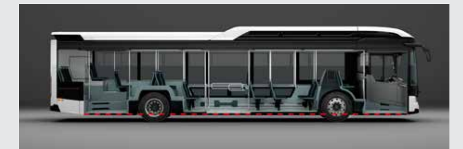
Chassis shown for illustrative purposes only.

The low entry point and flat floor throughout the bus increases accessibility for all passengers, including wheelchair users and children in strollers. In combination with the wide aisle, these features also contribute to efficient passenger flow.