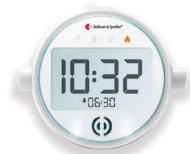
Alarm clock Uses sound, light & vibrations