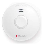
Smoke alarm Detects smoke and fire