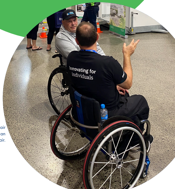
Expo attendee in a wheelchair having a discussion with an exhibitor, also in a wheelchair.