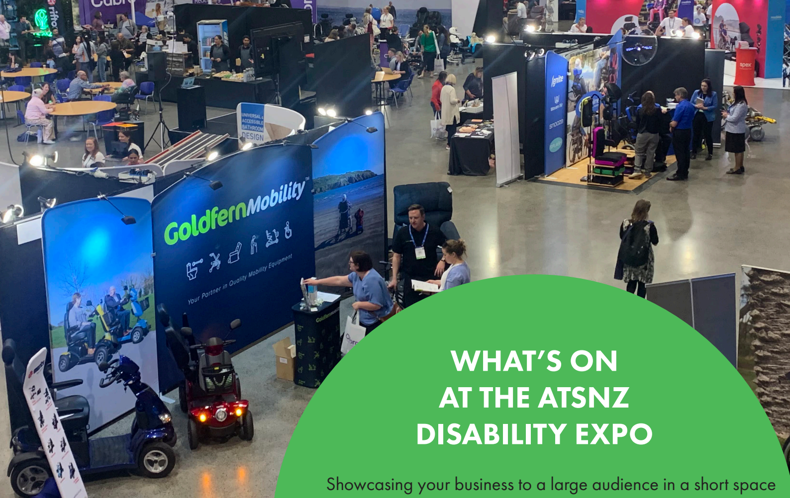
Wide angle of the Expo floor, with various exhibitor booths displaying equipment, and attendees looking around the booths.