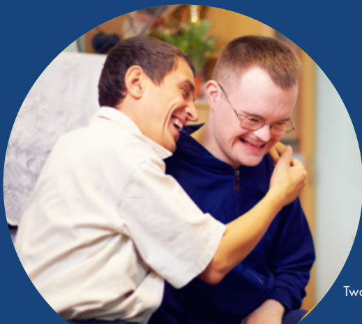
Two people laughing and embracing.