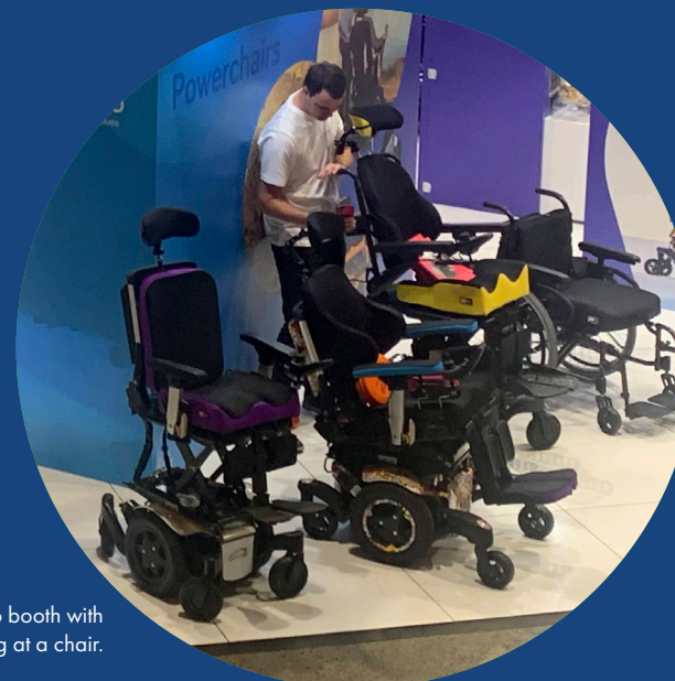
Power wheelchairs on an Expo booth with a person looking at a chair.