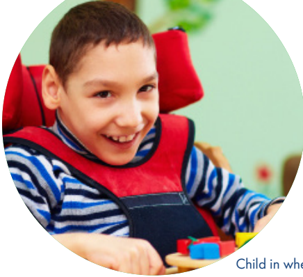
Child in wheelchair