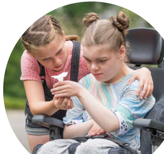
Two children, 1 in a power wheelchair both holding onto the same flower, engaged in conversation

Due Drop Events Centre, Manukau, Auckland