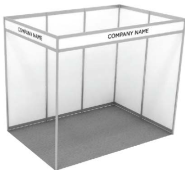
EXAMPLE EXHIBITION BOOTH