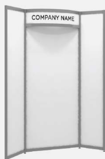
EXAMPLE NETWORKING POD