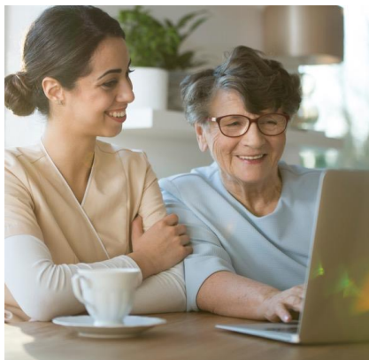
Workplace and simulation learning