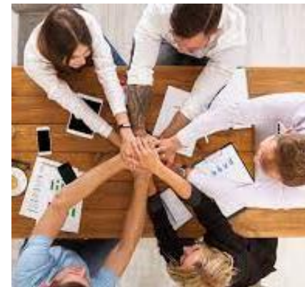
Peer to peer learning