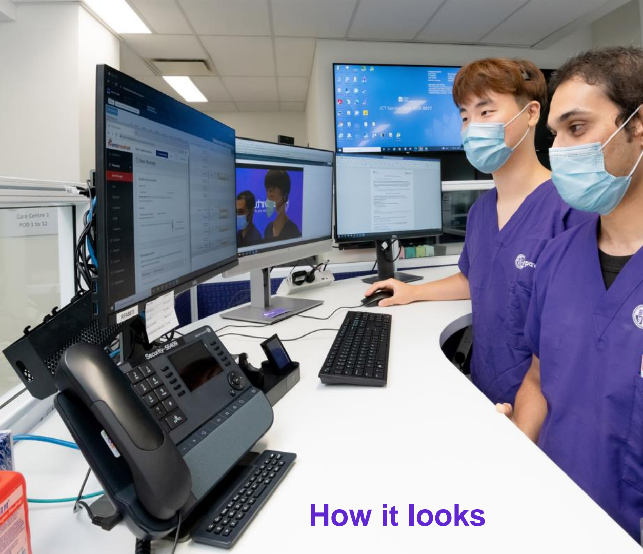
How it looks