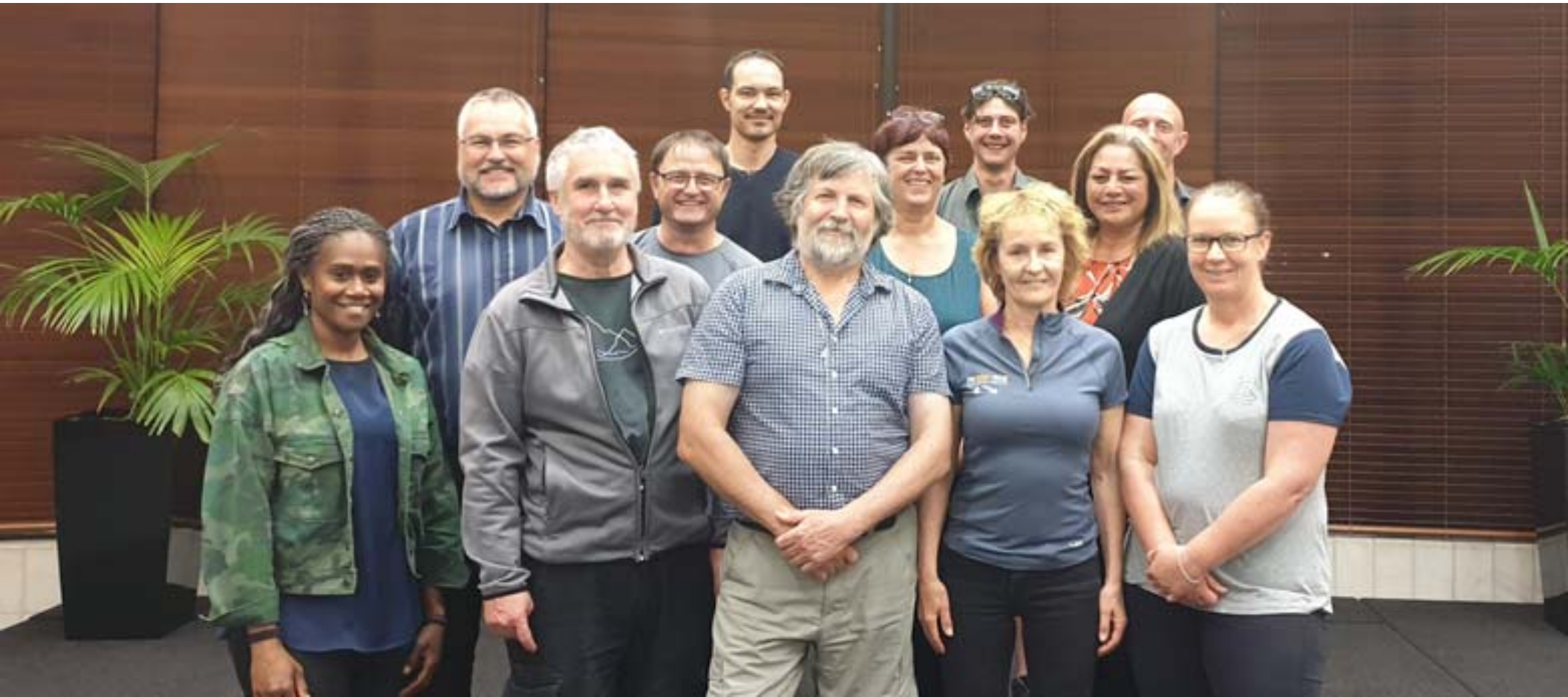
Right Track Waikato Whānau