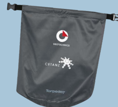
Previous version shown. Example only, actual bag may differ.