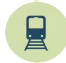
City Rail Link