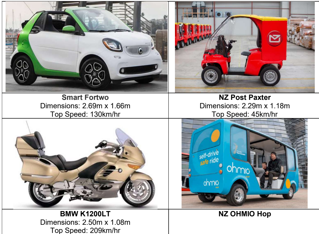
Figure 2 – microCAR models vs BMW K1200L