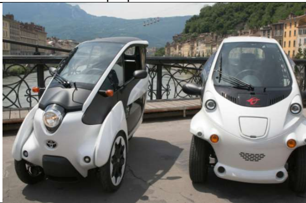
Toyota i-Road Dimensions: 1.70m x 0.85m Top Speed: 60km/hr