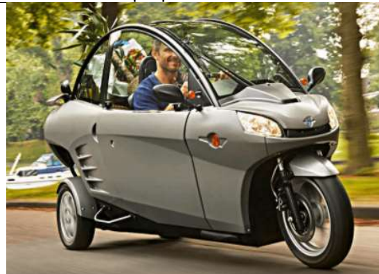
Carver Dimensions: 1.49m x 0.98m Top Speed: 45km/hr