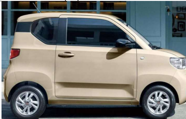
SAIC-GM-Wuling Hongguang Mini Dimensions: 2.91m x 1.49m Top Speed: 100km/hr