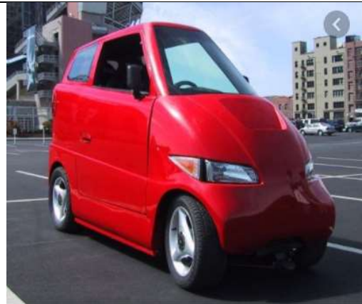
Commuter Cars T600 Dimensions: 2.60m x 0.99m Top Speed: 240km/hr