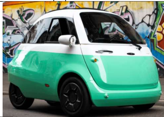
Microlino Dimensions: 2.43m x 1.50m Top Speed: 90km/hr