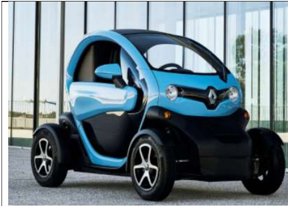
Renault Twizy Dimensions: 2.32m x 1.19m Top Speed: 80km/hr