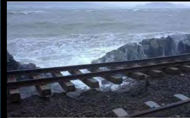
Figure 2.28 Strong southerly gales and high tides caused wave erosion and washout of the railway line near Ngā Ūranga in June 2013, David Morgan.