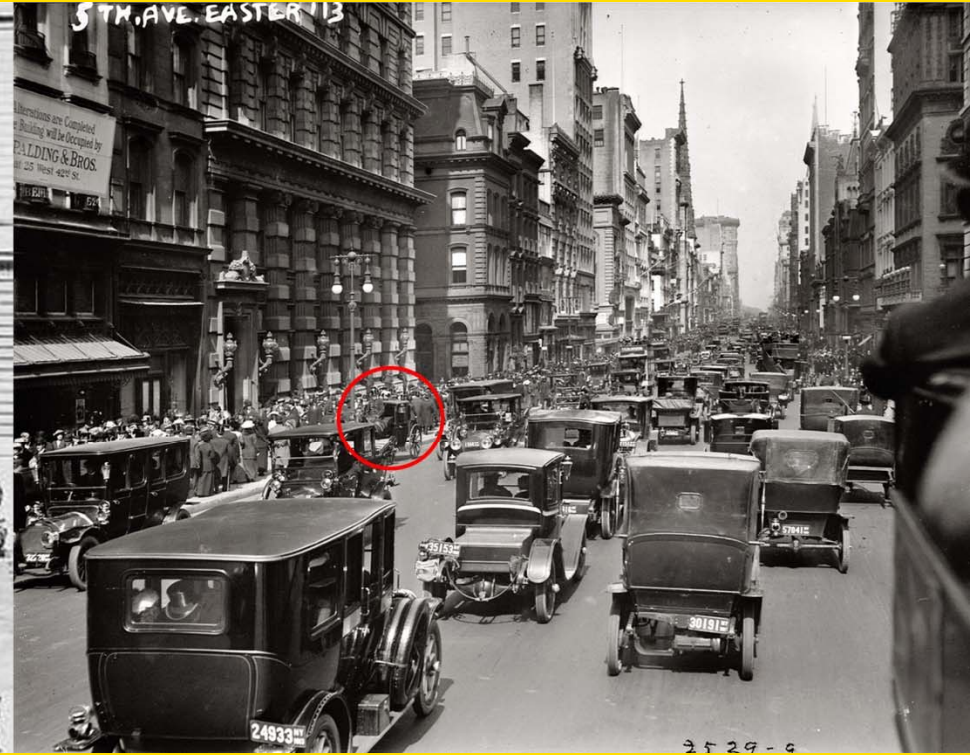
1913: One horse and carriage