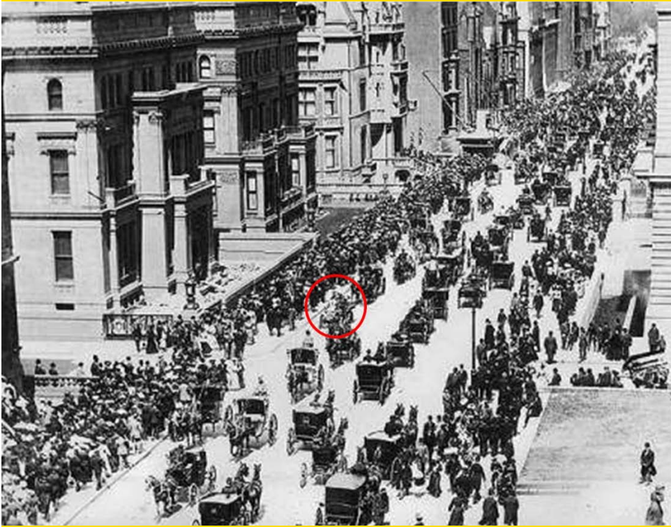
1900: One motor vehicle