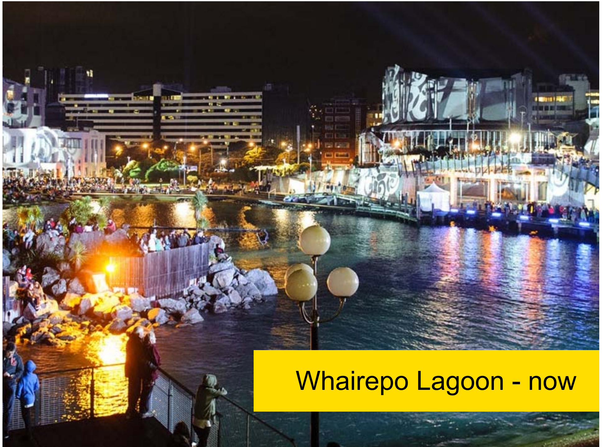
Whairepo Lagoon - now