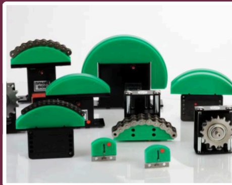
Tensioners & Profiles