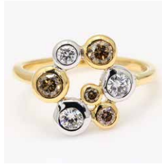
Confection 021175 in 18k two-tone gold