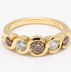
Delta 021058 in 18k YG