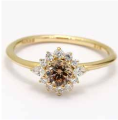
Exodus 250510 in 9k YG