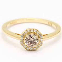
Apiary 260756 in 9k YG