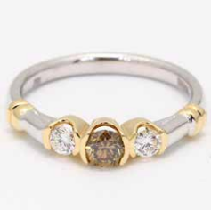
Eyre 030808 in 18k two-tone gold