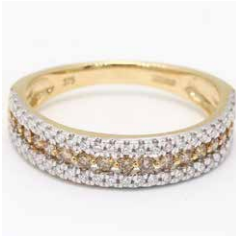
Leah 2500636 in 9k two-tone gold