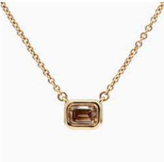
Lumiere 2800673 in 9k YG