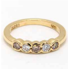
Aurelia 260622 in 18k YG