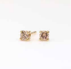
Sparkling 0.20ct 150567 in 9k YG