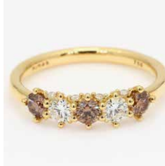
Daphne 0201499 in 18k YG