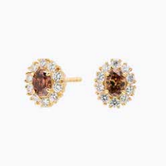
Choir 3100611 in 18k YG