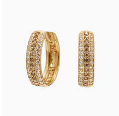
Ombre 3100591 in 9k YG