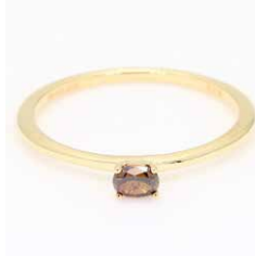
Ellipse 2600890 in 9k YG