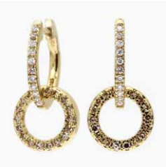
Echo 300260 in 9k YG

Colourful clusters, stately studs and glittering hoops add a sparkling warmth to the every day!