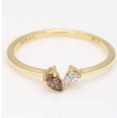
Petaline 2600877 in 9k YG