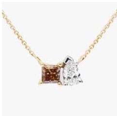
Genesis 2800683 in 18k two-tone gold