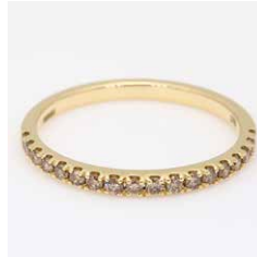
Montage 0800449 in 9k YG