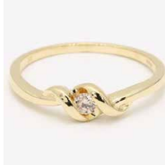
Temple 260361 in 9k YG