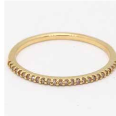
Love So Fine 080418 in 18k YG