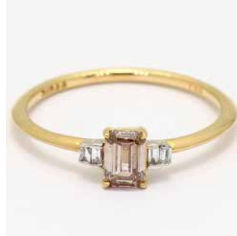
Millie 250525 in 18k two-tone gold