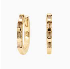
Melody 3000362 in 9k YG