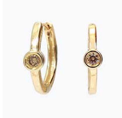
Noelle 1500683 in 9k YG