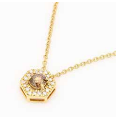
Apiary 2700418 in 9k YG