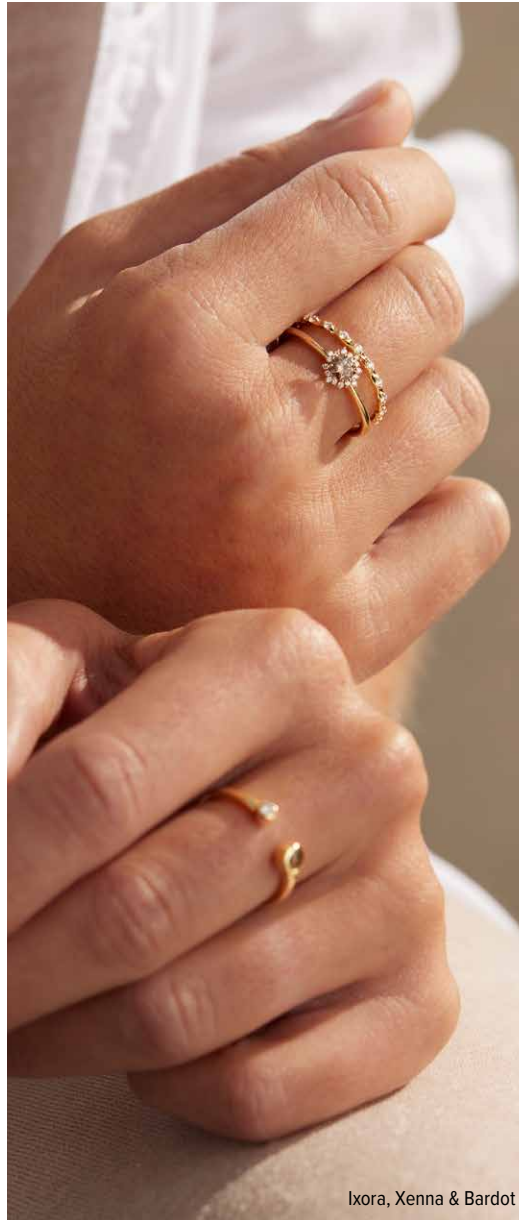
Ixora, Xenna & Bardot

Variations All rings are available in custom colour variations of both metal and diamonds. All rings will be supplied in default size 'O' unless otherwise advised. Other sizes may incur an additional fee. Please contact our Admin team to discuss your preference.