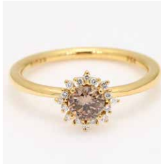
Ixora 031042 in 18k YG