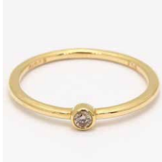
Armada 260779 in 18k YG