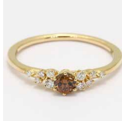
Nova 260741 in 9k YG