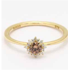
Ixora 260736 in 9k YG