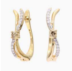
Kiara 300189 in 9k YG