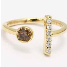
Madonna 260764 in 9k YG