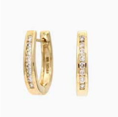
Peyton 3000376 in 9k YG