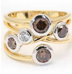
Champgne Bubbles 020783 in 18k two-tone gold