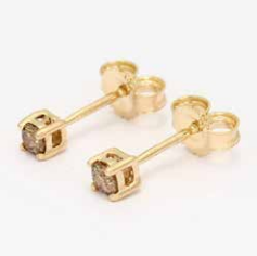
Sparkling 0.10ct 150565 in 9k YG