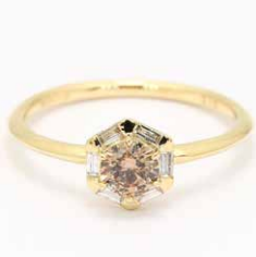
Aroma 260787 in 9k YG