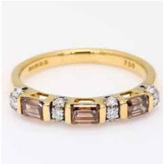
Umber 0201534 in 18k two-tone gold