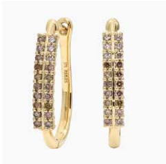
Lyric 3100602 in 9k YG