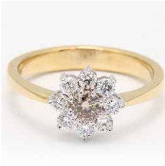
Precious 250290 in 9k two-tone gold