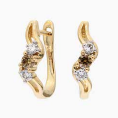
Tiana 300187 in 9k YG