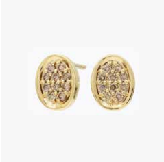
Elisa 300247 in 9k YG