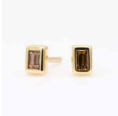
Elixir 3000359 in 9k YG