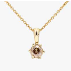
Sparkling 270241 in 18k YG