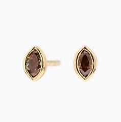
Elixir 3000364 in 9k YG