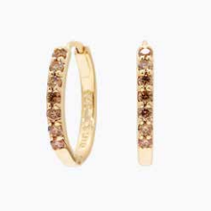
Melody 3000372 in 9k YG