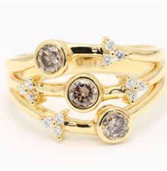
Destiny 030578 in 18k YG