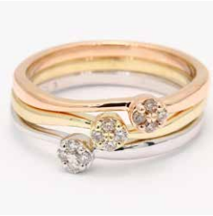
Heron 260569 in 9k three-tone gold