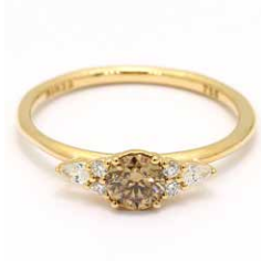
Cedar 030982 in 18k YG