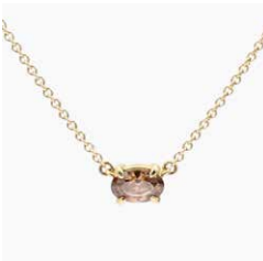
Ellipse 2800684 in 9k YG