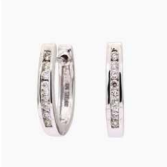
Peyton 150244 in 9k WG