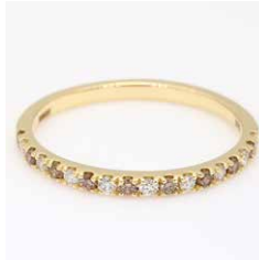
Medley 0800450 in 9k YG