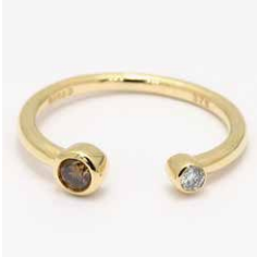
Bardot 260720 in 9k YG