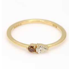
Calerry 2600873 in 9k YG