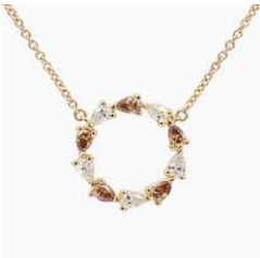
Wreath 2800672 in 9k two-tone gold