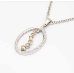
Kylie 270222 in 9k WG