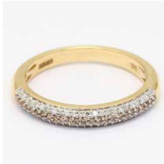
Ombre 260698 in 9k two-tone gold