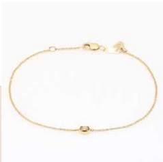
Sparkling 1800187 in 9k YG