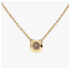
Lumiere 270252 in 18k YG