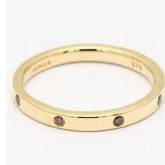
Bengal 260730 in 9k YG