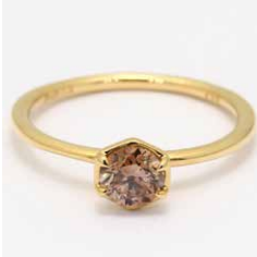
Honey 030965 in 18k YG