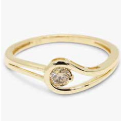
Arya 260367 in 9k YG