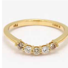
Convex 0800446 in 18k YG