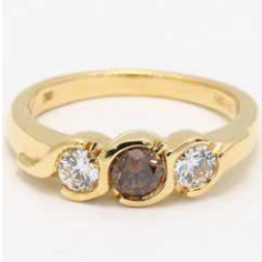
Selena 020821 in 18k YG