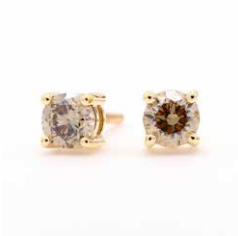
Sparkling 0.75ct 310345 in 18k YG