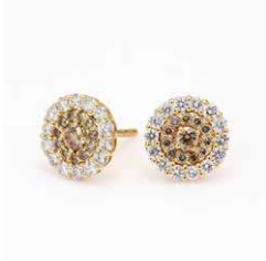
Cherish 3000374 in 9k YG