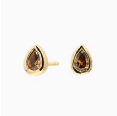
Elixir 3000368 in 9k YG