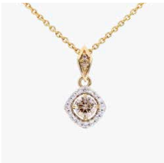
Regan 270223 in 18k two-tone gold