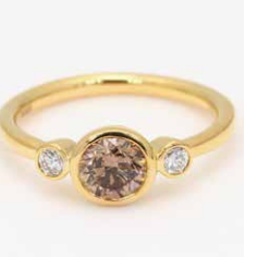
Equinox 021410 in 18k YG