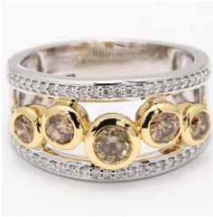
Pathway 020776 in 18k two-tone gold