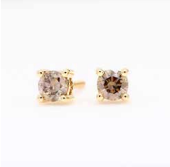
Sparkling 0.50ct 3100628 in 18k YG