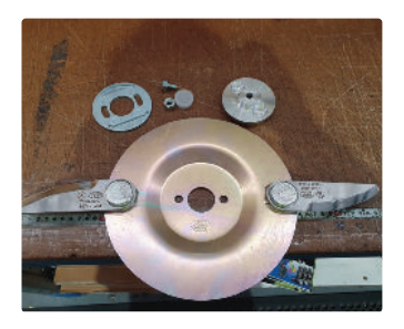
DISKS WITH FLAIL BLADES FOR TOPPING VINES POST HARVEST