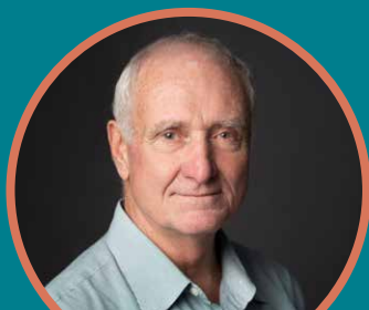
Robyn Williams AO

Leading Australian Science Journalist and Broadcaster