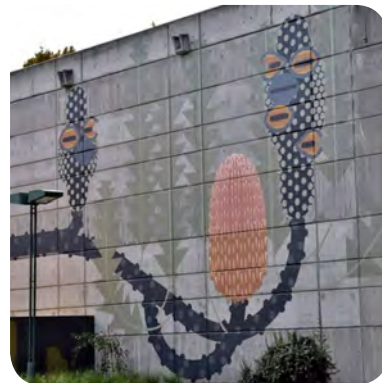
'Banksia Menziesii' Artist: Amok Island