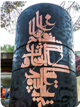
'Bridges' Artist: Karim Jabbari

As this activation project unfolded over a week it captivated the campus community and provided opportunity for students to watch and learn from the world's best contemporary street artists, providing a type of learning that cannot be achieved within the classroom.