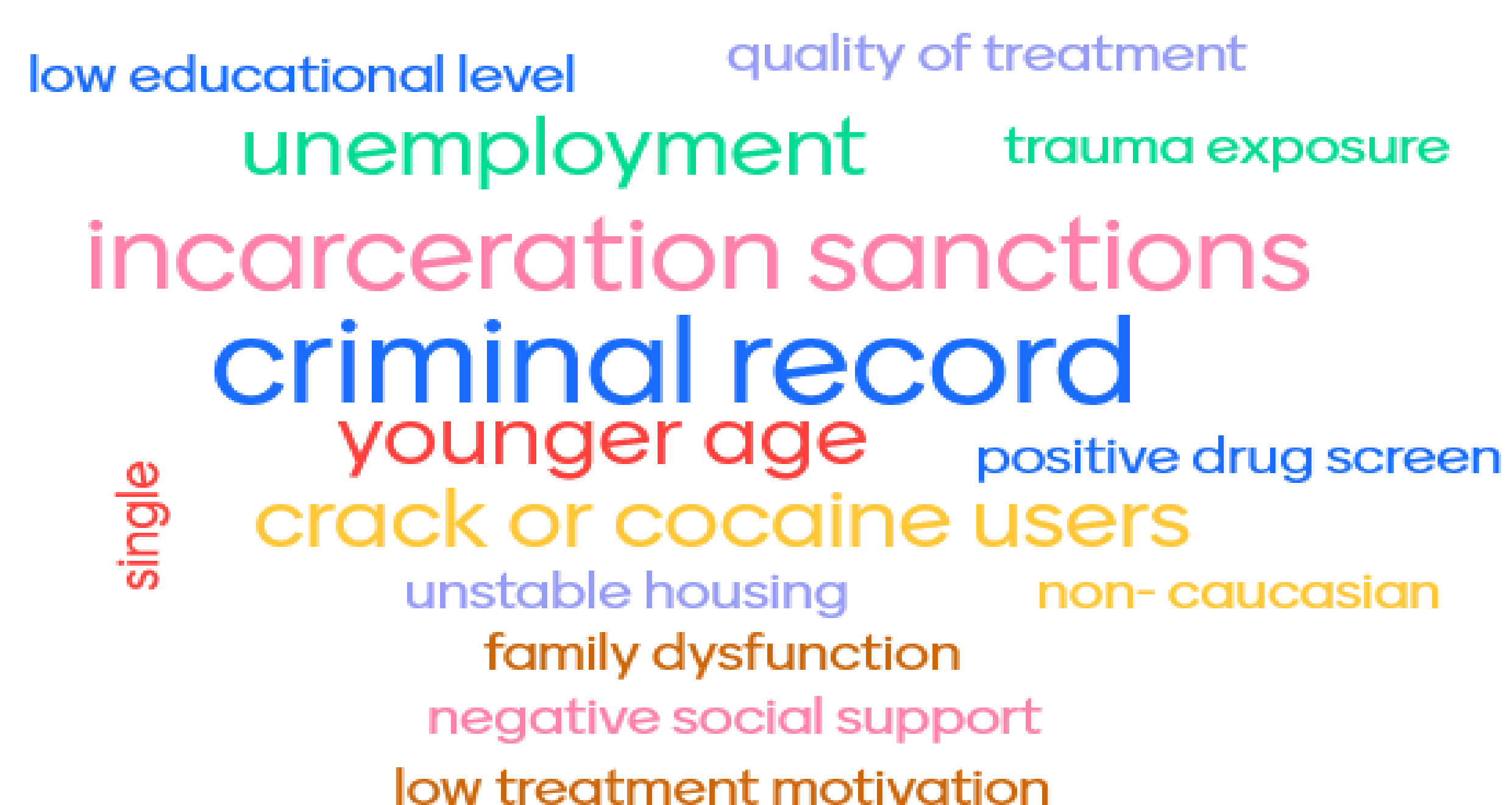
Fig 3: Factors affecting treatment non-completion