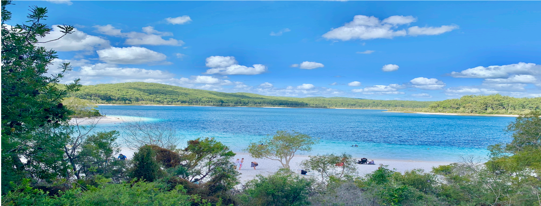
Lake McKenzie at K'Gari (Fraser Island)