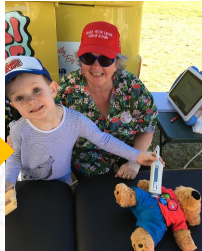
Fibroscan if needed