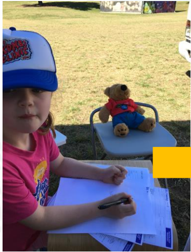
See a GP