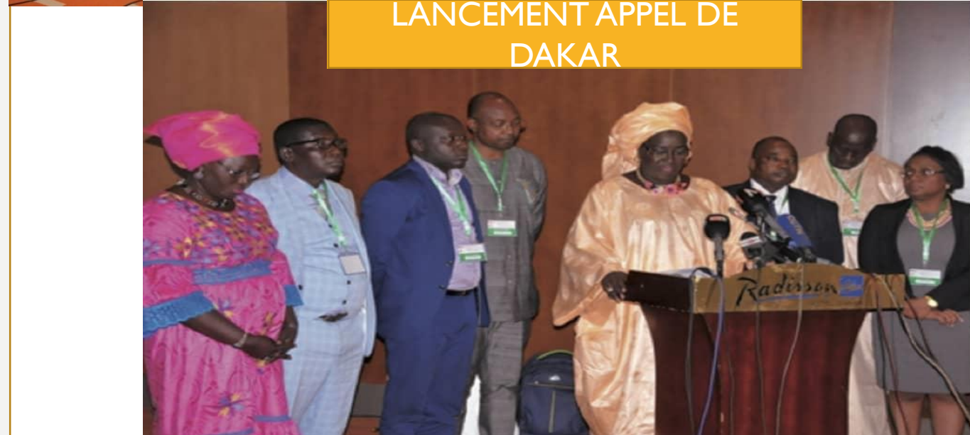
LANCEMENT APPEL DE DAKAR