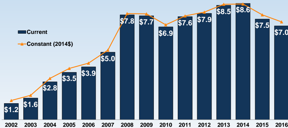
Donor Government Disbursements for HIV, 2002-2016