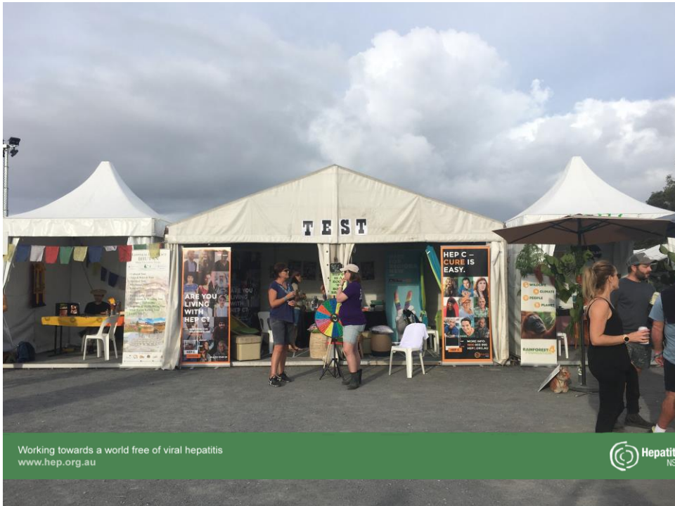
Working towards a world free of viral hepatitis www.hep.org.au