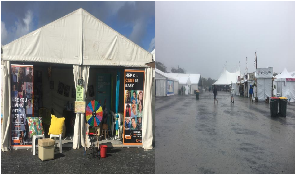
Working towards a world free of viral hepatitis www.hep.org.au