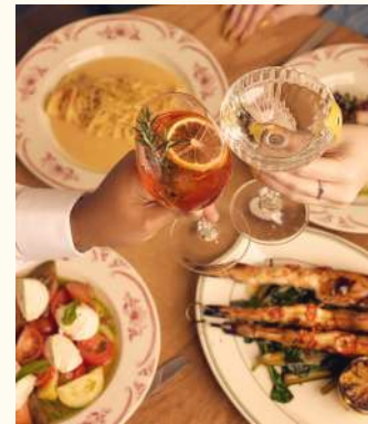
Settimo, The City