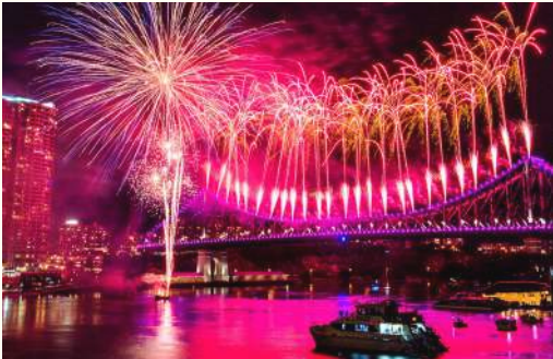
Brisbane Festival, Citywide