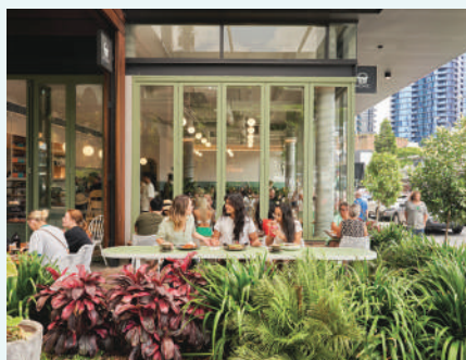
West Village, West End