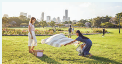
New Farm Park, New Farm