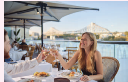
Tillerman, The City

Discover Brisbane's acclaimed dining scene along the river, visit stunning rooftop restaurants and bars with unparalleled views of the city skyline and uncover hidden gems in laneways – from urban wineries to speakeasy-style cocktail bars.