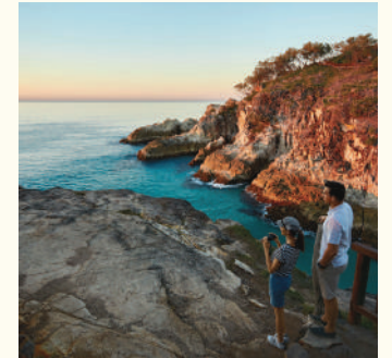
North Stradbroke Island/Minjerribah