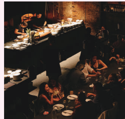
Agnes, Fortitude Valley