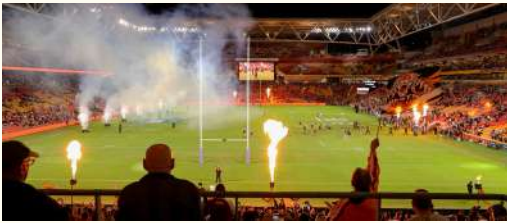
Suncorp Stadium, Milton

Whether you're fixed on a foodie event, sporting showdown, exclusive art exhibition or live performance, Brisbane is buzzing with events. From heart-stopping to heart-warming, in-stadium to on-stage, scan the QR code below and mark your calendar with Brisbane's epic line-up of events.