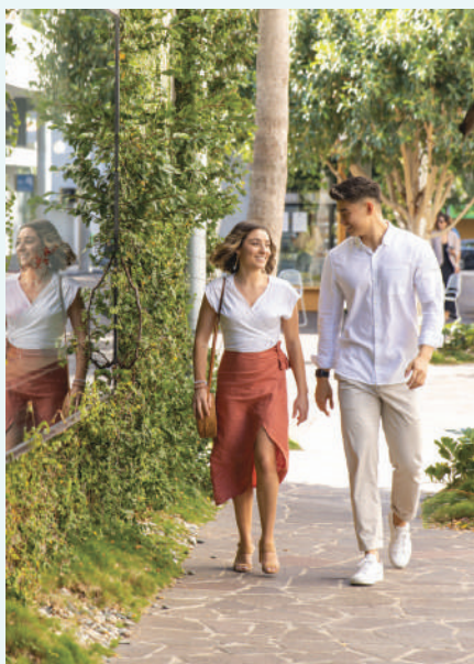
James Street, Fortitude Valley