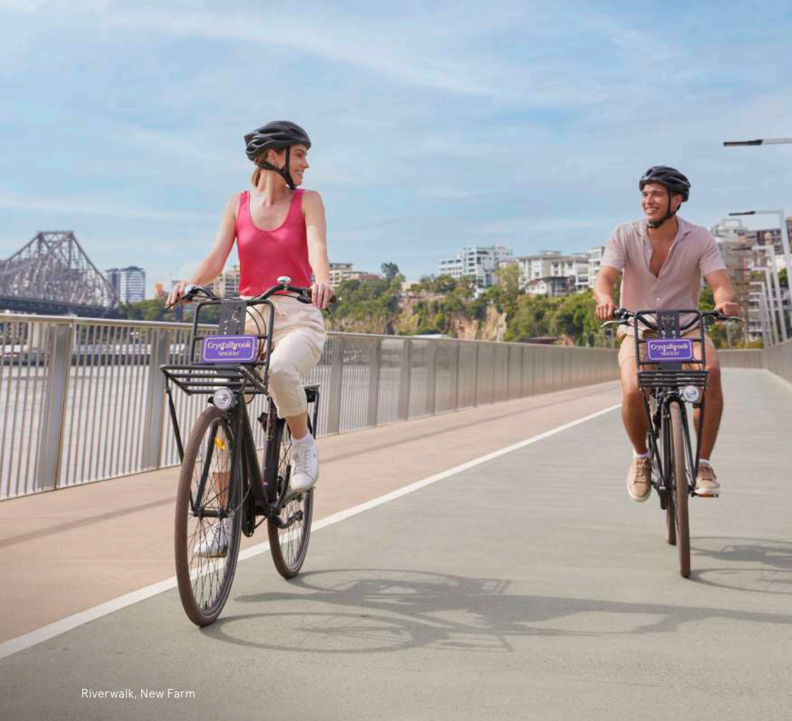
Riverwalk, New Farm

Get around Brisbane easily, whether it's walking, cycling or on public transport – from buses to trains and even ferries on the river. Scan below for more details and to plan your journey with Translink.