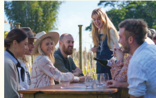
Witches Falls Winery, Tamborine Mountain