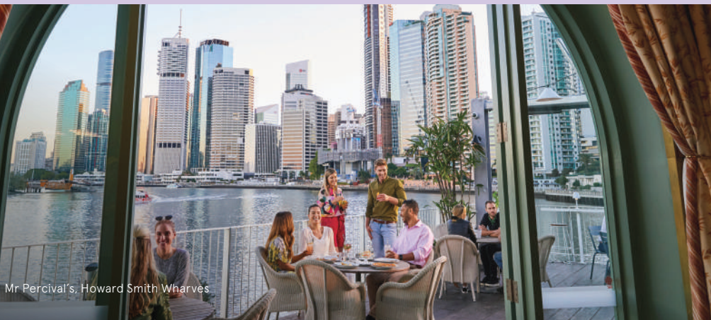
Mr Percival's, Howard Smith Wharves