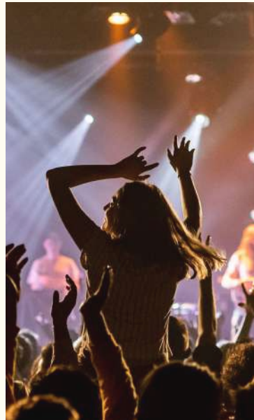
The Tivoli, Fortitude Valley