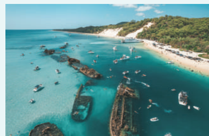
Tangalooma Wrecks, Moreton Island/Mulgumpin