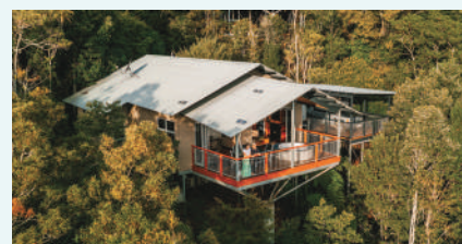
O'Reilly's Rainforest Retreat, Lamington National Park