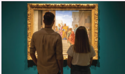
Gallery of Modern Art

From ticking off the major city attractions to culinary exploration or delving into Brisbane's rich First Nations culture, you'll never run out of things to do.