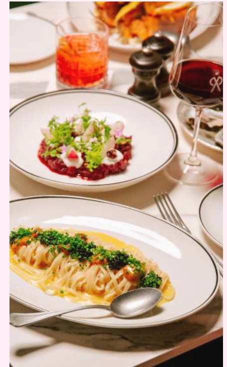
Rothwell's, The City