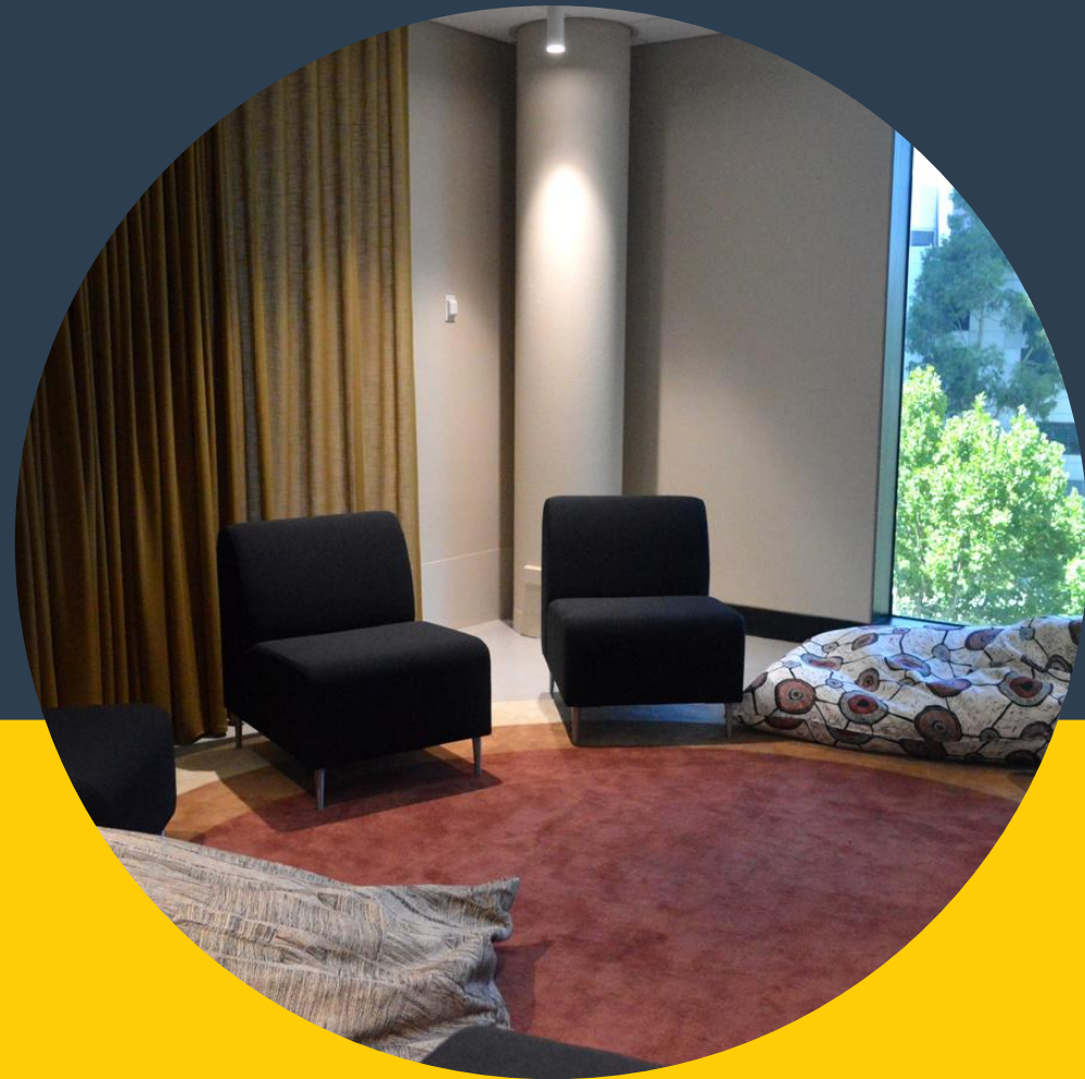
Culturally safe spaces