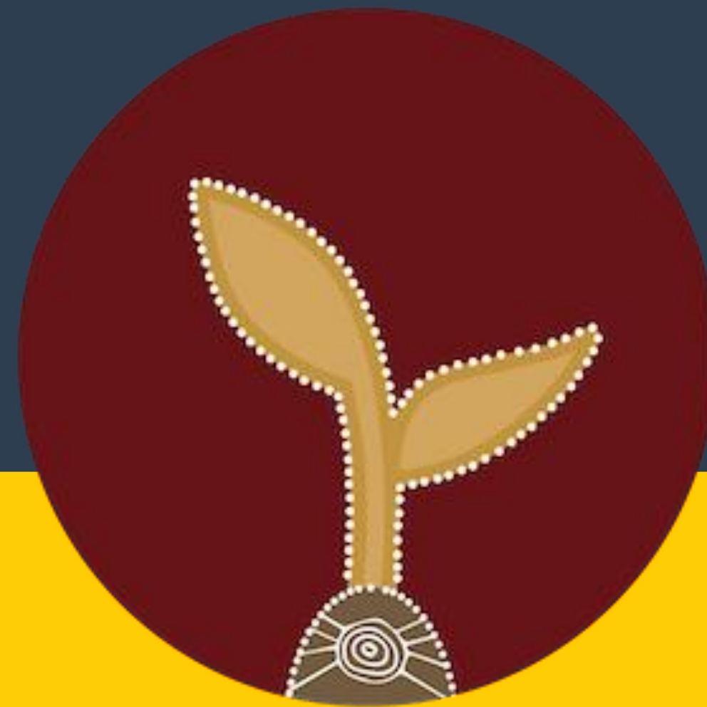
Cultural safety training