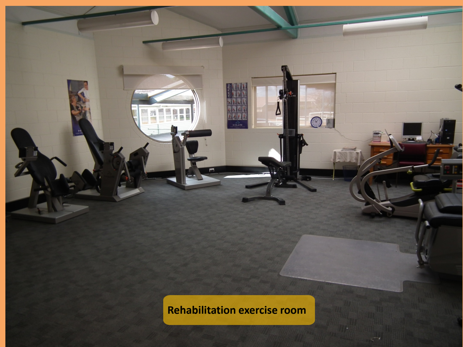
Rehabilitation exercise room