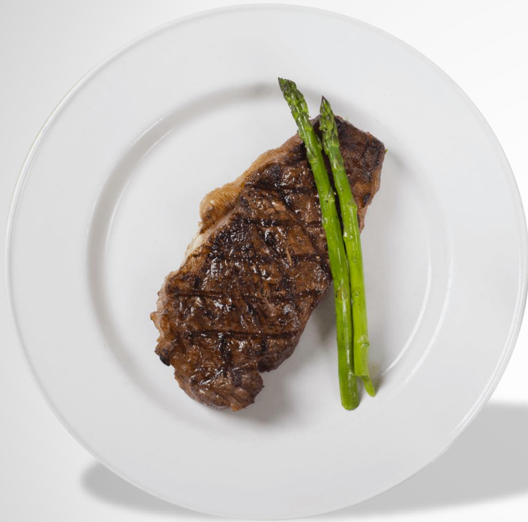
Randomized Controlled Trials