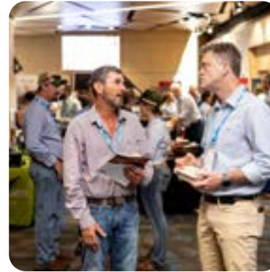
Half Page Advertisement $750

All artwork must be sent to sita@associatedadvertising.com.au by 30 September 2025