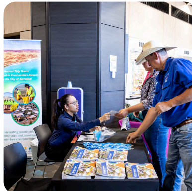
Full Page Advertisement $1000