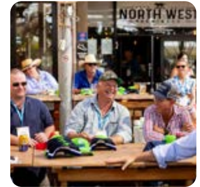
Quarter Page Advertisement $500