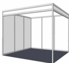
Corner booth image