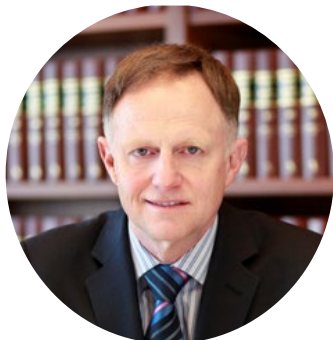
Chief Justice Stephen Gageler AC High Court of Australia

Stephen John Gageler was appointed to the High Court in October 2012, at which time he was Commonwealth Solicitor-General. He was then appointed as Chief Justice on 6 November 2023. He is a graduate of the Australian National University and has post-graduate qualifications from Harvard University. He was admitted as a barrister of the Supreme Court of New South Wales in 1989 and was appointed Senior Counsel in 2000. Before his appointment as Solicitor-General in 2008, he practised as a barrister extensively throughout Australia principally in constitutional law, administrative law and commercial law.