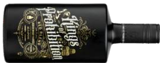
Kings or Prohibition Red Blend 2024 ABV 13%